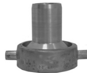
#-5932 Fitting to attach the 1 1/4 pressure hose to the 1 1/2 in engine discharge.