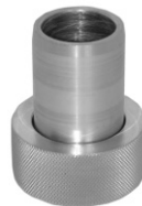
#-5931 Fitting to attach the 1 1/4 inch pressure hose to the suction nozzle.