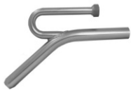
#-7620 1 1/2 x 1 1/4 inch suction nozzle