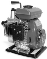
#-6525 JOBE 2.5 HP Gasoline Pump