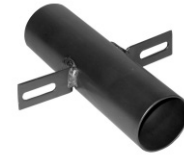
#-6540 1 1/2" Dredge Adapter