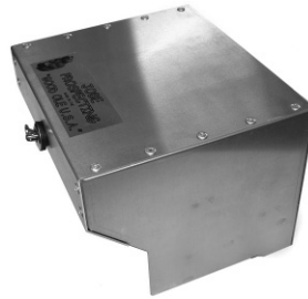
#-6550 Dredge header box